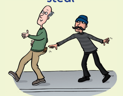
He's stealing the man's money.