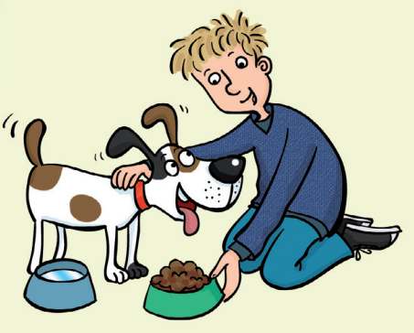
He looks after his dog.