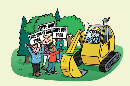
Save our park!