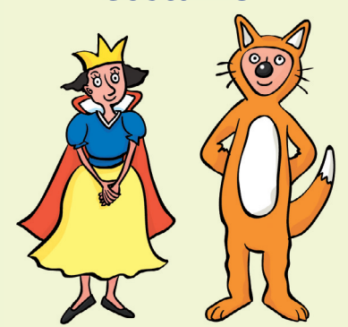
They are wearing costumes .