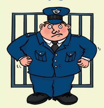
This man is a security guard .