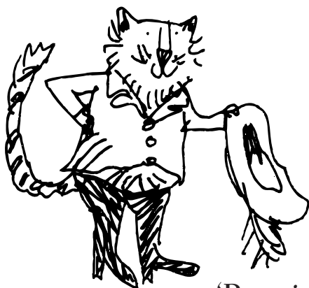
'Puss in Boots'