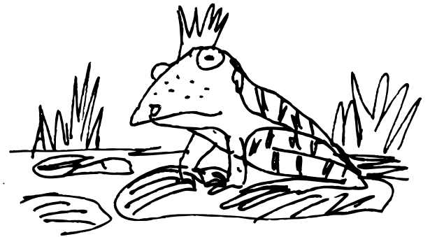
'The Frog Prince'

Some fairy tales are not so well known. Choose the title of a tale you haven't heard before and make up a story to go with it.