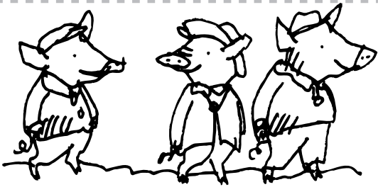
Three Little Pigs