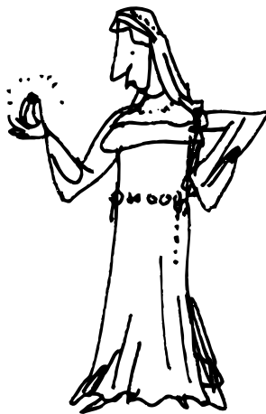
'The Princess and the Pea'

Some fairy tales are not so well known. Choose the title of a tale you haven't heard before and make up a story to go with it.