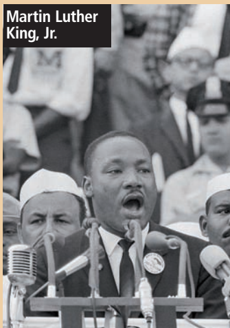
Martin Luther King, Jr.