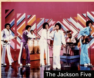
The Jackson Five

1960s Soul and R&B ('Rhythm & Blues') became very popular. Important artists at this time were James Brown and Aretha Franklin.