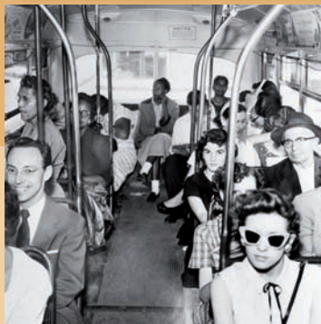
Black people had to ride at the back of buses.

In the early 1960s, nearly one hundred years after the end of slavery, black people still did not have the same rights as white people. In 1954 the high court in the USA said that racial segregation in schools was against the law. However, there was still segregation on buses and in restaurants, theatres and other public places.