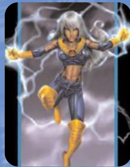
Storm in the X-Men comic