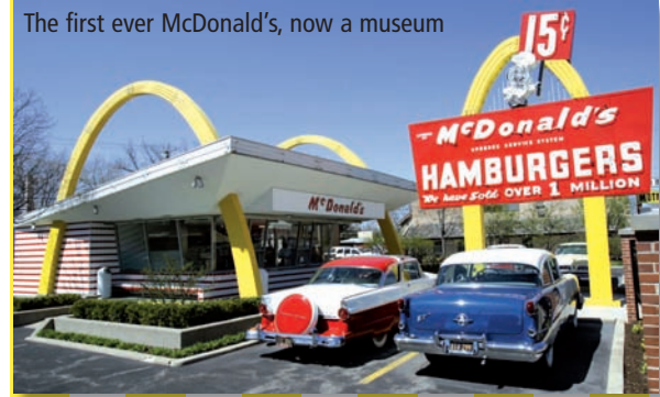
The first ever McDonald's, now a museum

It was the first self-service restaurant and it was hugely popular. It made the McDonalds a lot of money.