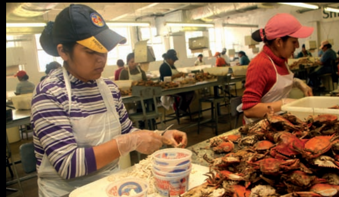
Immigrant factory workers

"We all share the same world. People should be able to work and live where they want." Discuss in class.