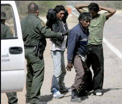
Border police with illegal immigrants

The US-Mexico border is over 3,000 km long. There are lots of high fences, and the US border police watch the area closely. Immigrants walk for hours in the desert heat to find places to cross where there are no police. Some try to swim or sail across the Rio Grande. Every year, Mexicans die during the journey. This is usually because they don't have enough water.